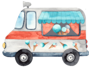
Ice Cream Truck